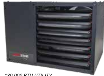
*80,000 BTU UTILITY HEATER SHOWN