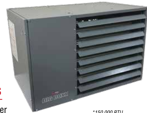
*150,000 BTU UNIT HEATER SHOWN

Please note: unit dimensions and weights are subject to change