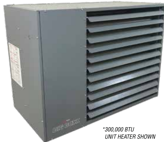
*300,000 BTU UNIT HEATER SHOWN