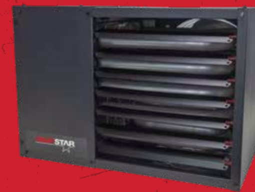
*80,000 BTU UTILITY HEATER SHOWN