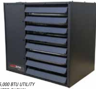
*125,000 BTU UTILITY HEATER SHOWN