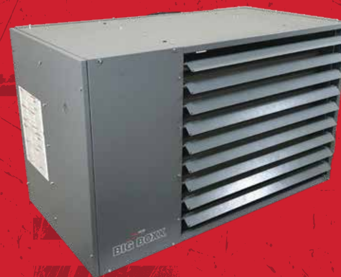
*200,000 BTU UNIT HEATER SHOWN