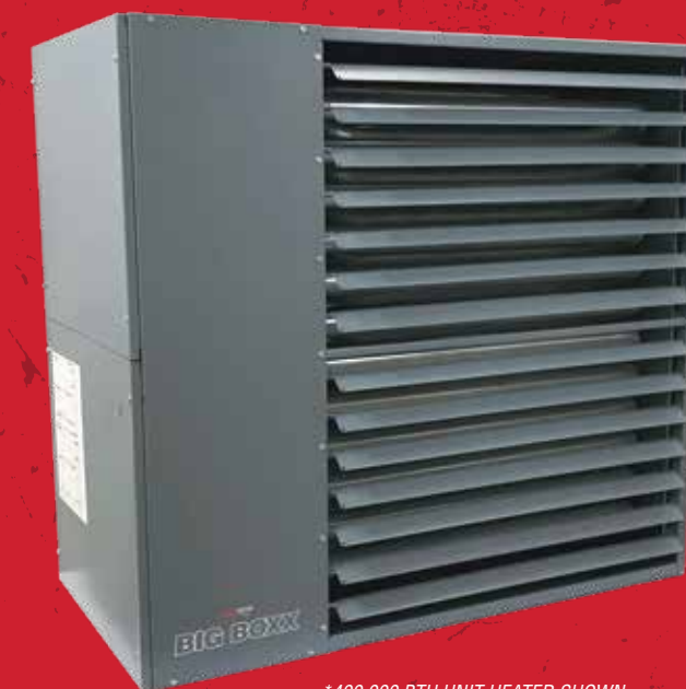
*400,000 BTU UNIT HEATER SHOWN