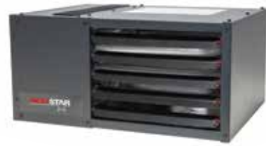
*50,000 BTU UTILITY HEATER SHOWN